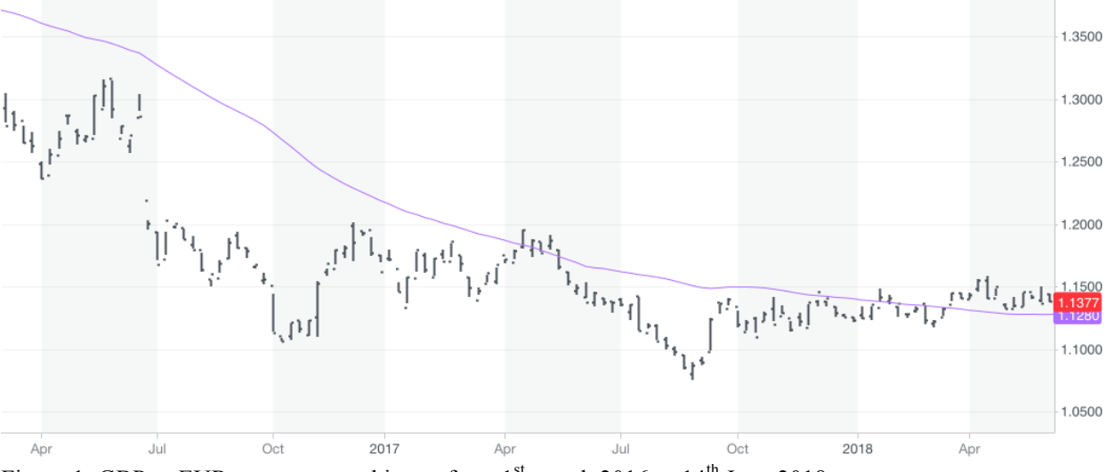
Figure 1: GBP to EUR currency rate history from 1<sup>st</sup> march 2016 to 14<sup>th</sup> June 2018

The Bank of England stepped in shortly after Brexit and injected liquidity £445 billion (Quantitative Easing Asset Purchase Programme £435 billion and Corporate Bond purchases £10 billion) into the market by creating electronic money – a process known as quantitative easing (Bank of England https://www.bankofengland.co.uk/monetary-policy/quantitative-easing). While these funds undoubtedly stabilized assets such as house prices, the creation of electronic money reduces the value of actual money resulting, increasing price inflation and currency devaluation simultaneously. Unless social housing providers were given an increase in annual budget as a quantitative easing bonus, the real value of their budget was decreased although the nominal value appeared stable. The decreased value of the budget coupled with increased volatility in the marketplace makes managing the maintenance and upgrade of social housing units much more challenging.